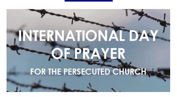
Sunday 15th November.

Please remember all those in other lands paying a high price for their Christian faith often to the point of death. Some are in prison, some rejected by their communities and families, and children isolated from their peers, and downgraded in schoolwork.