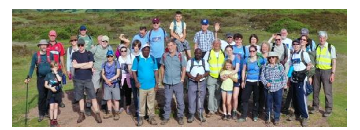
Save the date...... 'Walk for Water' on Saturday 21st June...in aid of WATSAN. More details to follow.